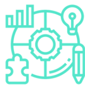
Business and Digital Transformation