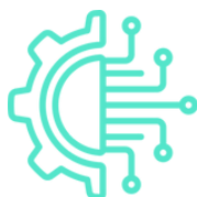
Data and Technology