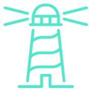
Strategic Change and Programme Delivery