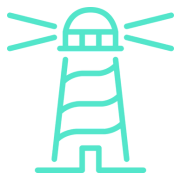
Strategic Change and Programme Delivery